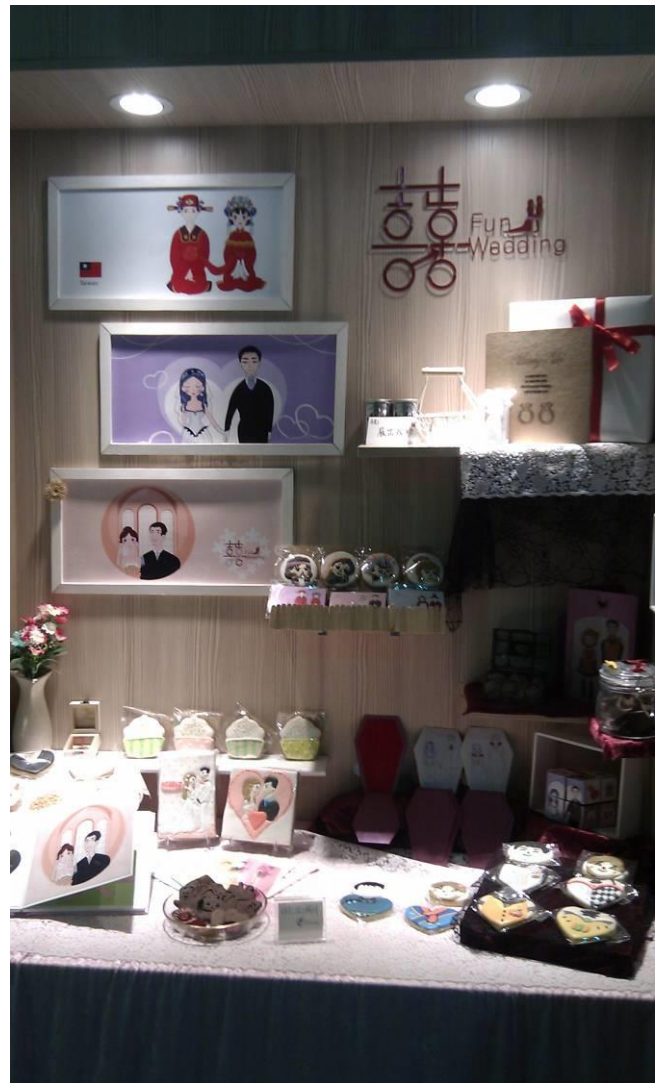
Fig. 1. Design results