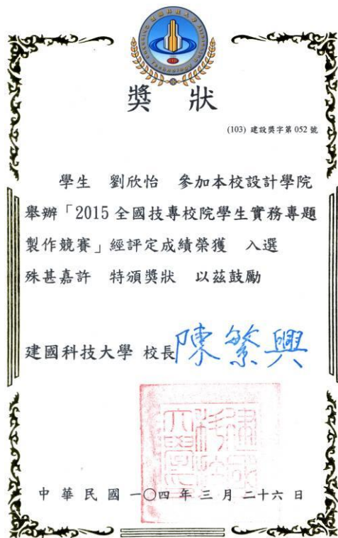
Fig. 2. Get the project competition